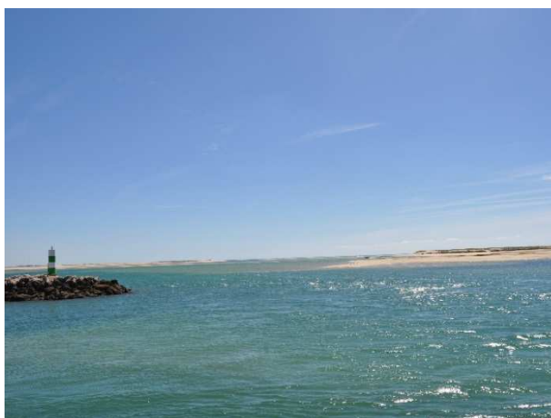
Figure 2.4. Sampling station 3 – Fuzeta.