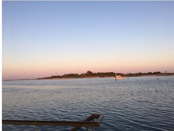
Figure 2.5. Sampling station 4 – Tavira.