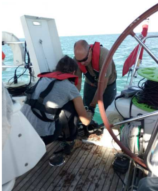
Figure 2.8. Sampling station 7 – Faro-Olhão inlet.