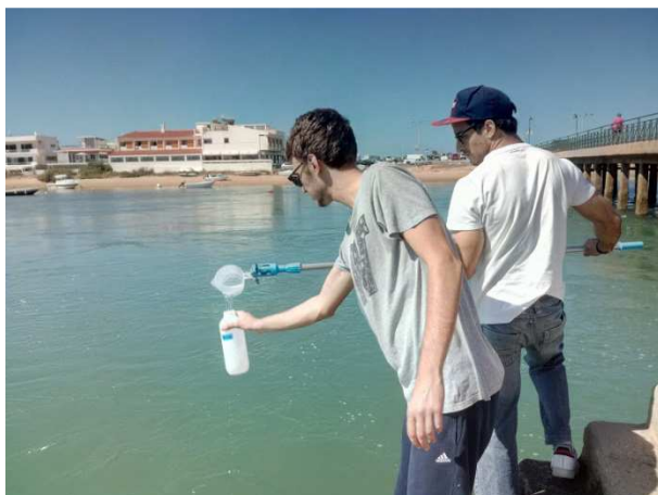
Figure 2.2. Sampling station 1 – Bridge of Faro Beach.