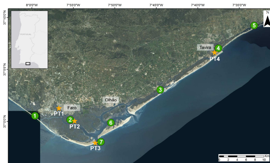
Figure 2.1. General overview of the study area and location of the sampling stations: 1 – Bridge of Faro Beach; 2 - Cais do Combustível; 3 – Fuzeta; 4 – Tavira, 5 – Cacela; 6 – Olhão channel; 7 – Faro-Olhão inlet. The stars correspond to the location of 4 pressure transducers: Bruce’s Yard (PT1); Cais do Combustível (PT2); Deserta Island (PT3); and Quatro Águas de Tavira (PT4).

To cover the entire lagoon, seven stations were selected ( Error! Reference source not found. ) including the different water bodies (WB) of the Ria Formosa, as described by APA (Agência Portuguesa do Ambiente). Five stations were located in the main channels, although at inner areas and comprise: station 1 – Bridge of Faro Beach representative of Ria Formosa WB1; station 2 – Cais do Combustível that represent the Ria Formosa WB2; station 3 – Fuzeta representative of Ria Formosa WB4; station 4 – Tavira under the influence of freshwater input that represents the Ria Formosa WB5; and station 5 – Cacela also located in the Ria Formosa WB5. Stations 6 at the Olhão channel and 7 at the Faro-Olhão inlet are representative of the most external area of Ria Formosa. The last one will also be used to characterize the adjacent oceanic conditions.