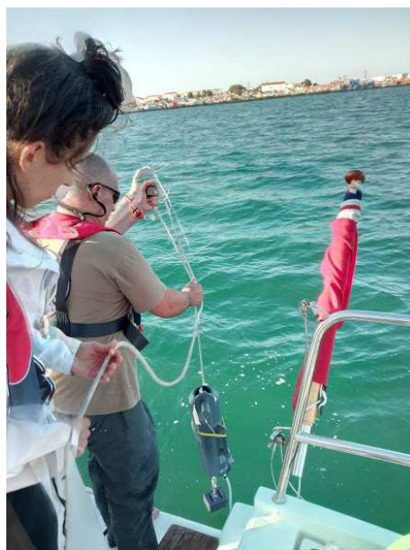
Figure 2.7. Sampling station 6 – Olhão channel.