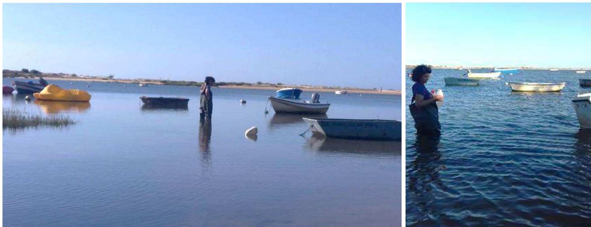
Figure 2.6. Sampling station 5 – Cacela.