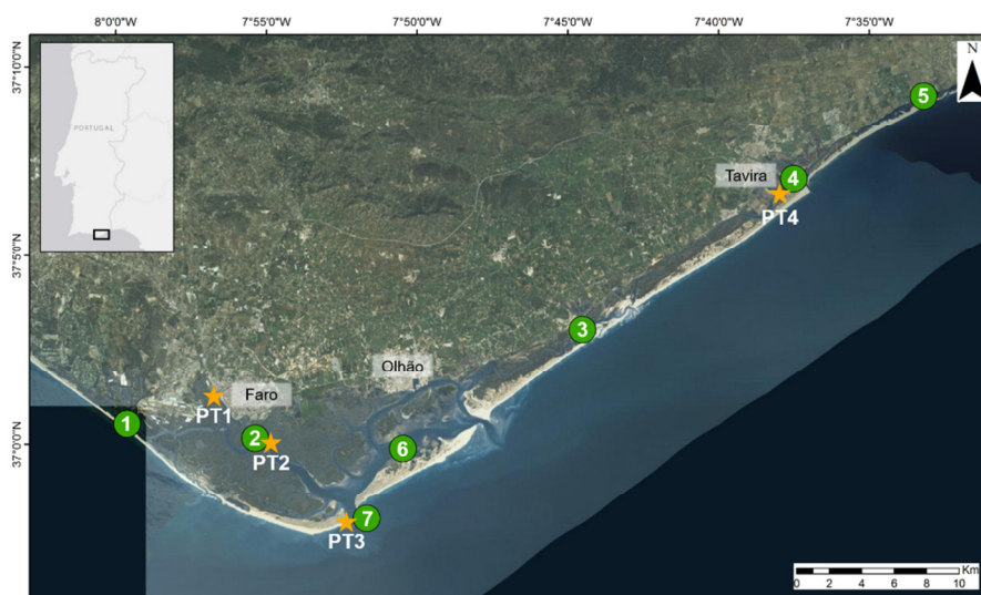
Figure 2.1. General overview of the study area and location of the sampling stations: 1 – Bridge of Faro Beach; 2 - Cais do Combustível; 3 – Fuzeta; 4 – Tavira, 5 – Cacela; 6 – Olhão channel; 7 – Faro-Olhão inlet. The stars correspond to the location of 4 pressure transducers: Bruce's Yard (PT1); Cais do Combustível (PT2); Deserta Island (PT3); and Quatro Águas de Tavira (PT4).

A field survey was carried out in October, including seven stations, like in the two previous campaigns, to comprise the different water bodies (WB) of the Ria Formosa, as described by APA (Agência Portuguesa do Ambiente) ( Error! Reference source not found. ). Five stations were located in the main channels, although at inner areas: station 1 – Bridge of Faro Beach representative of Ria Formosa WB1; station 2 – Cais do Combustível that represents the Ria Formosa WB2; station 3 – Fuzeta representative of Ria Formosa WB4; station 4 – Tavira under the influence of freshwater input that represents the Ria Formosa WB5; and station 5 – Cacela also located in the Ria Formosa WB5. Stations 6 at the Olhão channel and 7 at the Faro-Olhão inlet are representative of the outer area of Ria Formosa (WB3). The last one will also be used to characterize the adjacent oceanic conditions.