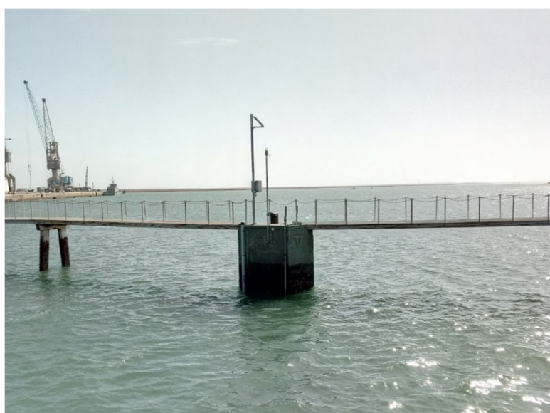
Figure 2.3. Sampling station 2 – Cais do Combustível located in the Port of Faro.