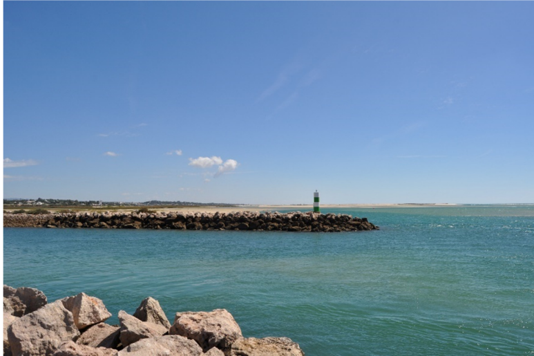
Figure 2.4. Sampling station 3 – Fuzeta.