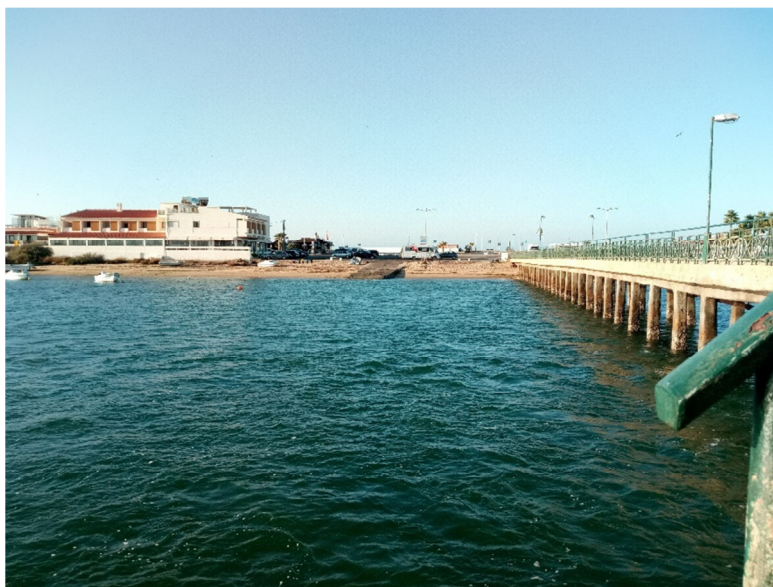
Figure 2.2. Sampling station 1 – Bridge of Faro Beach.

campaigns. At Tavira (the station with the highest potential to be influenced by freshwater input), to verify if stratification occurred in the water column, during the period of high influence from the river, in situ measurements were performed in the first sampling hour and at low tide, every 1 m along the water column and water samples were collected at both surface and bottom levels. The water samples, after collected, were transported to the laboratory in thermal containers to preserve their quality until further treatment.