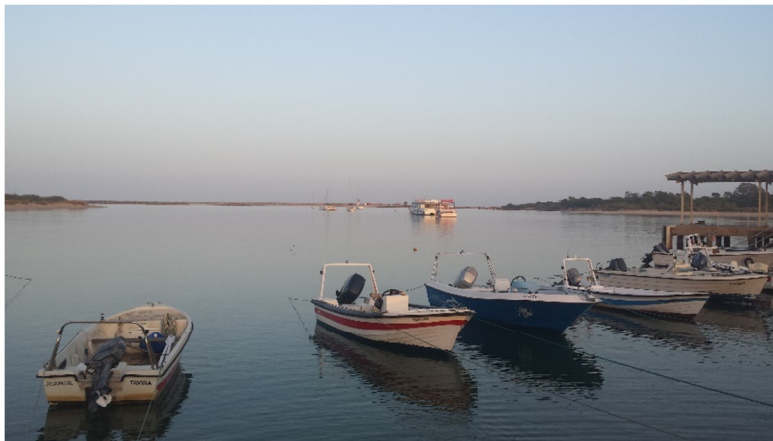
Figure 2.5. Sampling station 4 – Tavira.