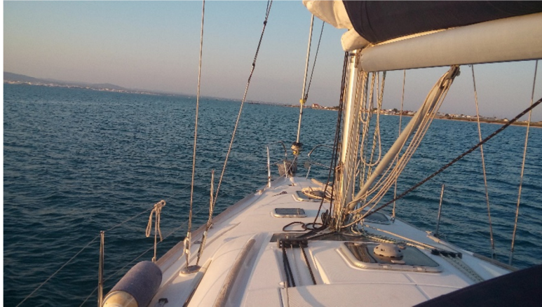
Figure 2.7. Sampling station 6 – Olhão channel.