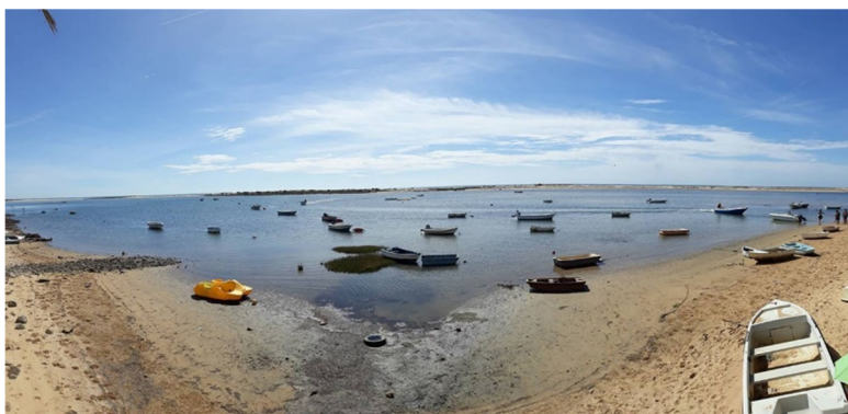
Figure 2.6. Sampling station 5 – Cacela.