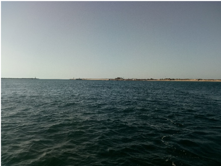
Figure 2.8. Sampling station 7 – Faro-Olhão inlet.

To study the physical conditions and circulation patterns within the Ria Formosa lagoon, the variation of the sea level was also measured by four pressure transducers (two Level TROLL, one Infinity and one DIVER) located in different sites (Figure 2.1).